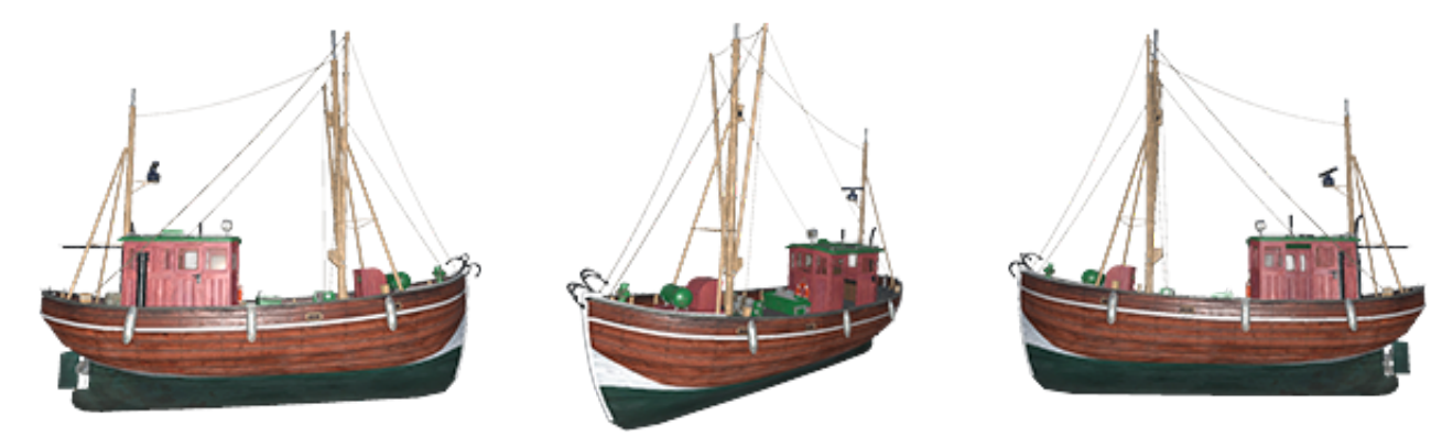
The new method of fishing - Trolling